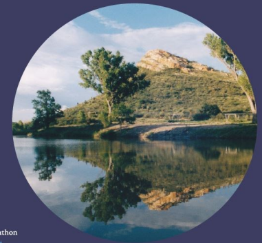
Post Park in Marathon