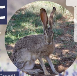
Big Bend Bluebonnets by Lesley Brown (background), Javelina (top inset), Jackrabbit (bottom inset)